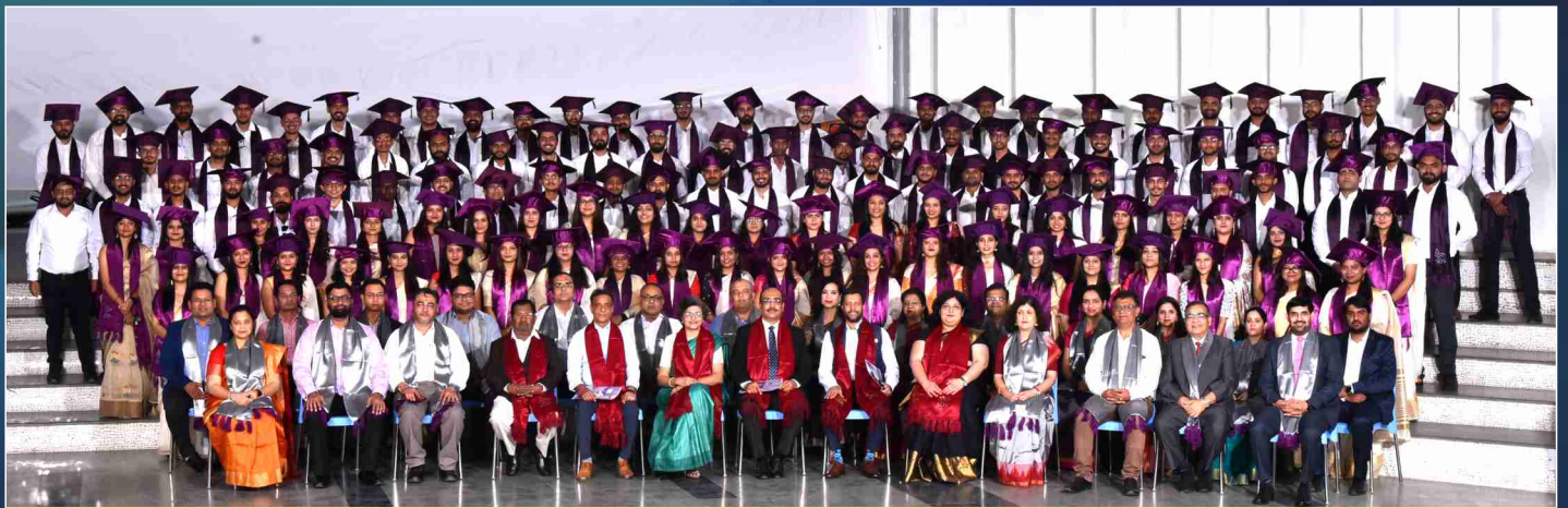
Graduating Candidates of 11 th Convocation with Chief Guest, GC members and Faculty.