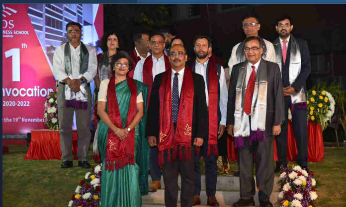
Chief Guest with GC Members and Faculty