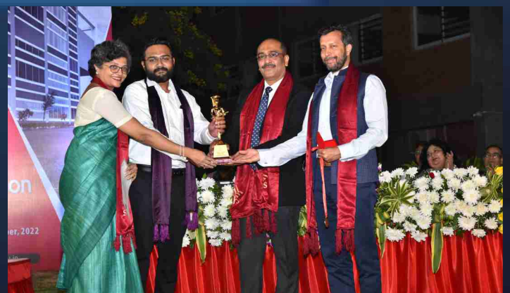
Receiving the diploma from the Director and Chairman Governing Council-